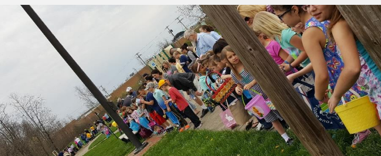
Easter Egg Hunt 2017 at the Shenango Township Park